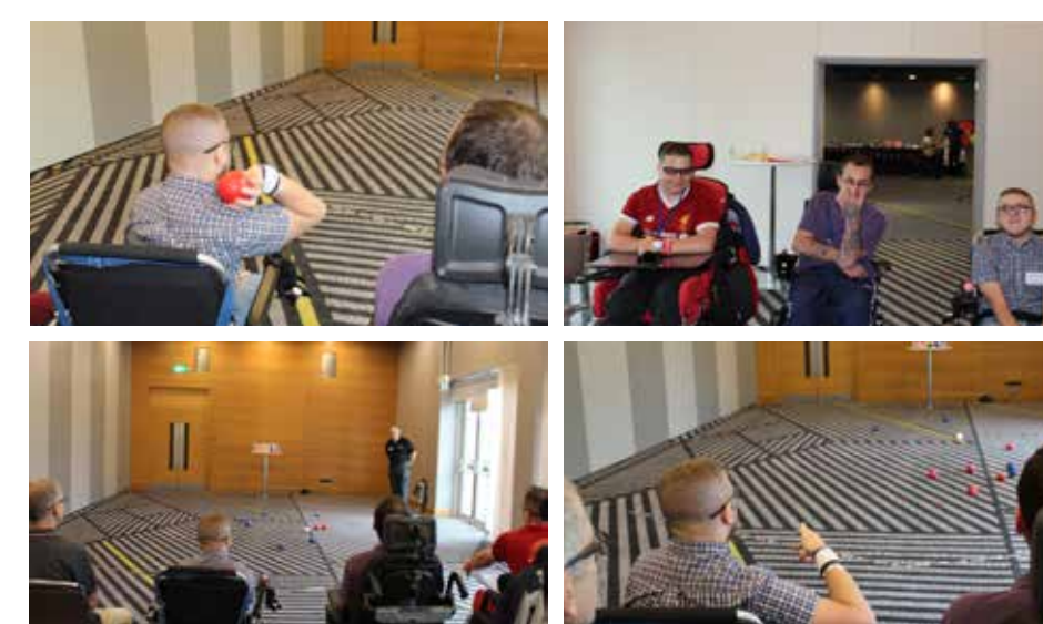
Playing Boccia at the Family Weekend

He now plays every Saturday, and has made lots of new friends and even met up with old ones from his old school. The club is part of