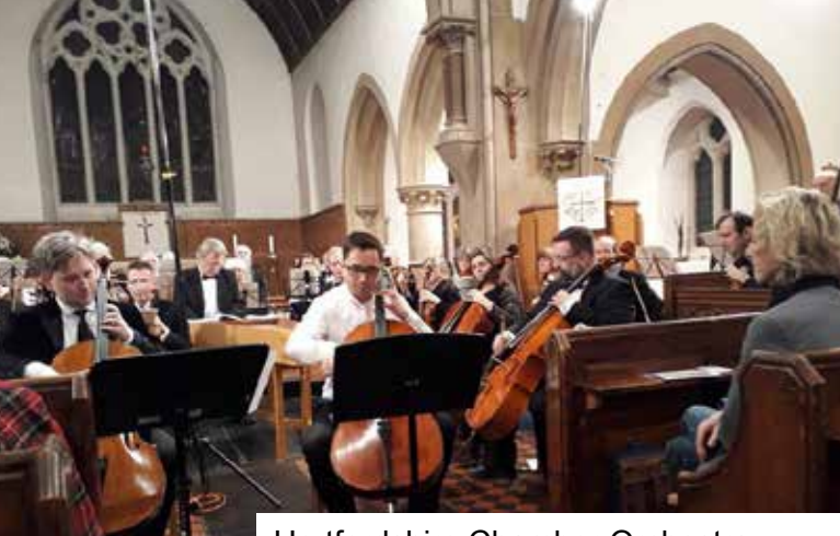
Hertfordshire Chamber Orchestra brightened a cold January night with a feast of classical music in Harpenden.

Jim Thompson treated guests to an evening river-boat trip from Totness to Dartmouth to view the Regatta firework display.