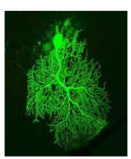
Purkinje cell.

If they succeed they will open the way to studies to understand what is happening in the Purkinje